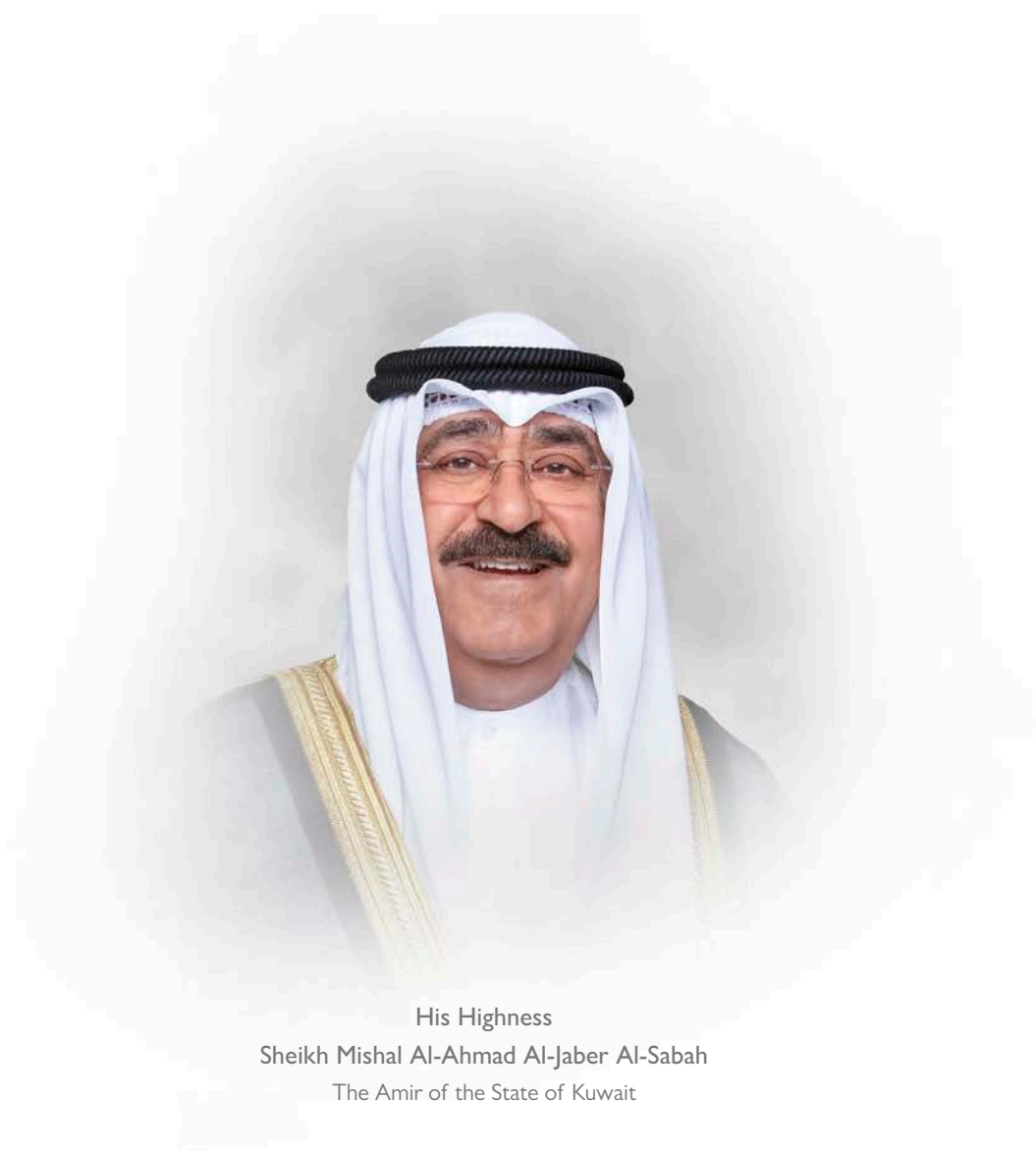
His Highness Sheikh Mishal Al-Ahmad Al-Jaber Al-Sabah The Amir of the State of Kuwait