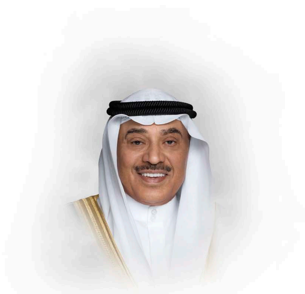
His Highness Sheikh Sabah Al-Khaled Al-Hamad Al-Sabah Crown Prince of the State of Kuwait